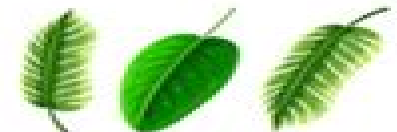
THREE TYPES OF LEAVES