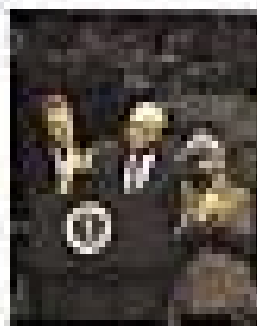
President Obama and Vice President Biden

What are the powers of the President? The President has the power to sign laws, veto laws, and appoint and remove federal judges. The President also has the power to declare war and to negotiate treaties. The President is also the commander in chief of the armed forces.