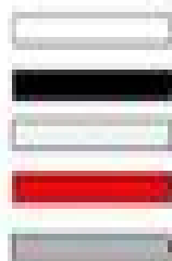
Small white plug x13598