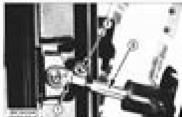
Figure 10-3 Tilt Cylinder Adjustment (1) Pivot eye (2) Bolt (3) Rod