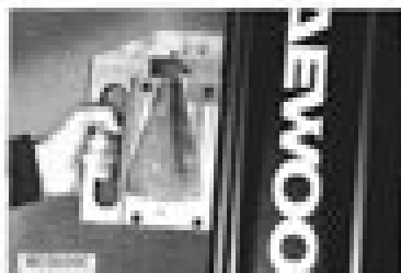
Figure 10-1 Tilt Angle Check

The tilt angle is determined by the cylinders used. See Tilt Cylinders in Specifications to determine the tilt angle from the cylinder being used.