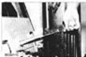
Figure 10-2 Tilt Cylinder Length Check (Rear)

Tilt the mast to full forward position. Measure the extended length of the cylinder rods from the cylinder housing to the mast. The length between the two cylinder rods must be within 2.54 mm (0.10 in) of each other.