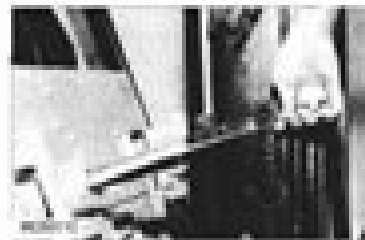
Figure 10-7 Drift Check