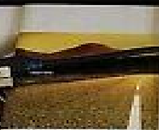
2013 Audi Models USA Warranty & Maintenance