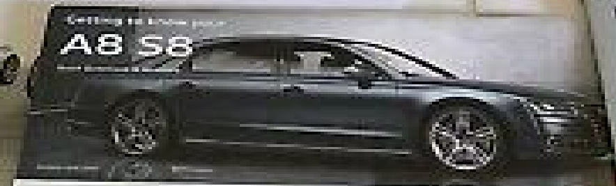
Getting to Know your A8 S8