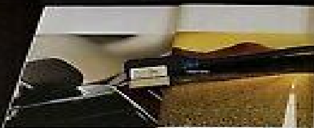
Operating Manual with Navigation Plus