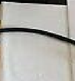
2013 Audi Models Exploring America's Top