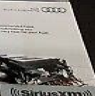
SiriusXM XM Satellite Radio