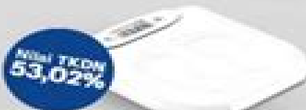
Timbangan Digital Bluetooth