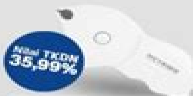
Alat Ukur LILA