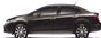
HONDA CIVIC LXR