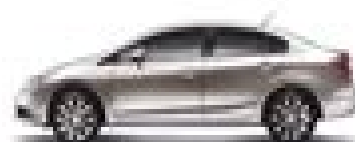
HONDA CIVIC EXR