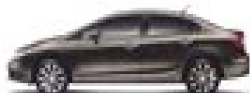
HONDA CIVIC LXS