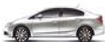
HONDA CIVIC LXR