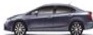
HONDA CIVIC EXR