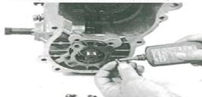
Pinion Retainer Plate Bolt Torque: 6-12 ft.lbs. (8-16 Nm)