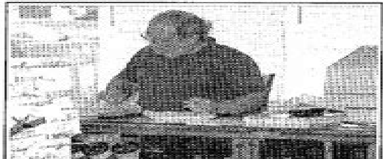
Fig. 2 By far the most important asset in purchasing parts is a knowledgeable and enthusiastic parts person