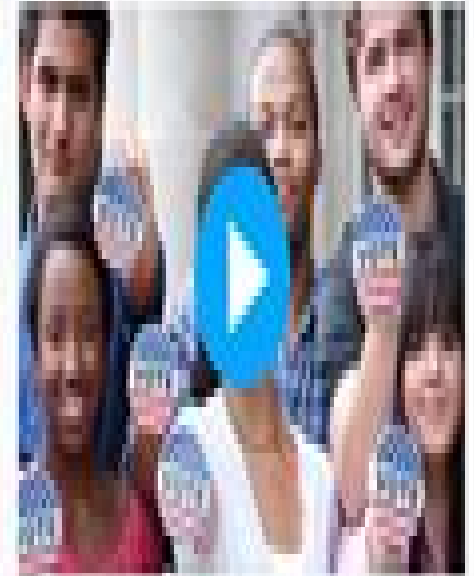
The Fight for Voting Rights