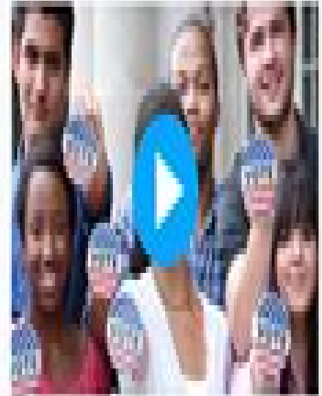
The Fight for Voting Rights