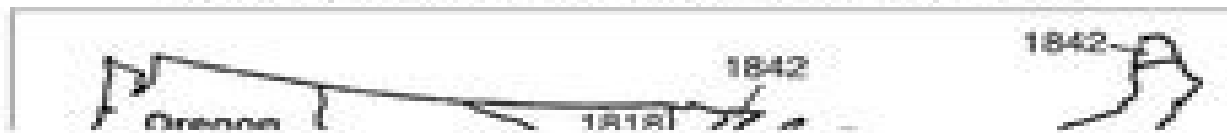
Territorial Growth of the United States (1783–1853)

#1: According to Source 1 and your knowledge of history, which territory acquisition changed the United State's landscape the most? Explain why. Source 1 Map of Western Expansion *