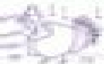
1. Boy and Girl

Children will experience how readers & the author/illustrator use the knowledge of the sequence events in the story as the plot moves from one event to the next and use the imagination to create the story's meaning.