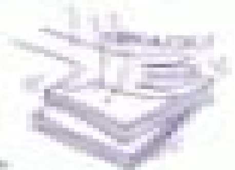
3. The boy

100 100 100 100 100 100 100 100 100 100 100 100 100 100 100 100 100