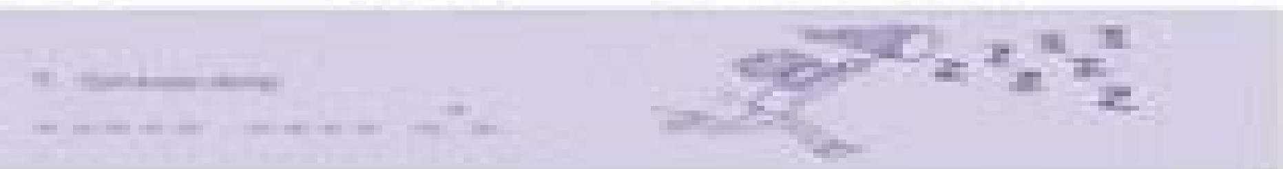
7. The boy and girl

100 100 100 100 100 100 100 100 100 100 100 100 100 100 100 100 100