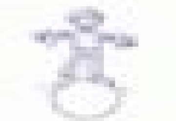
4. The boy and girl