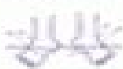
2. The boy and girl

100 100 100 100 100 100 100 100 100 100 100 100 100 100 100 100 100