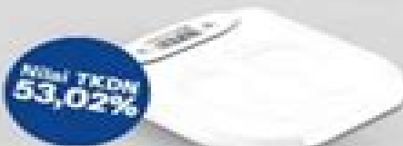
Timbangan Digital Bluetooth