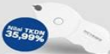
Alat Ukur LILA