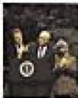
President Barack Obama and Vice President Joe Biden at a campaign event.

The American government is a republic, which means that the people elect representatives to make decisions for them. The government is divided into three branches: the executive, the legislative, and the judicial. The executive branch is headed by the president, the legislative branch by the Congress, and the judicial branch by the Supreme Court.