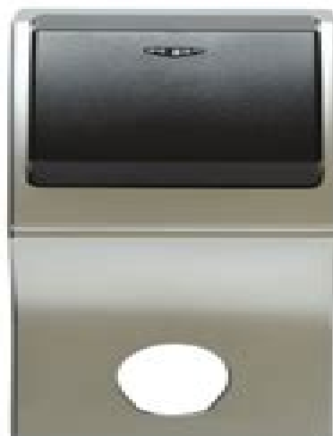
HT RFID Upgrade Kit