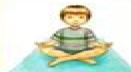
E Easy Pose