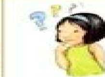
N New Pose