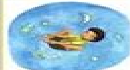
H Happy Baby