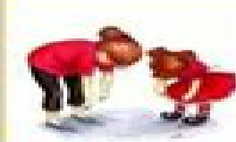
R Rag Doll