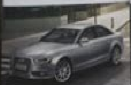
Owner's Manual 000 000 000 000