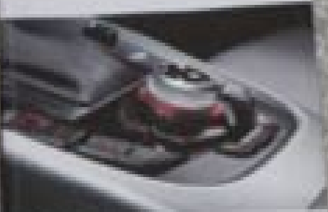
Owner's Manual 000 000 000 000