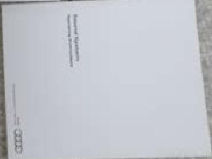
Owner's Manual 000 000 000 000