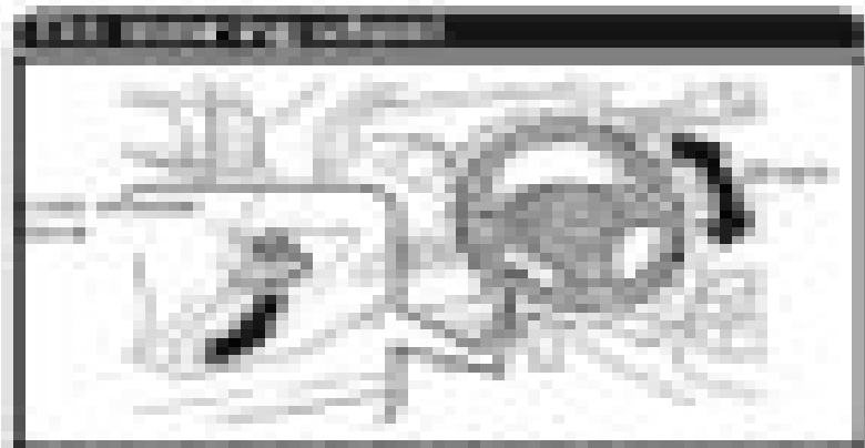
FIGURE 12.11 A flower (left) and a seed (right) and the seedling that grows from the seed.