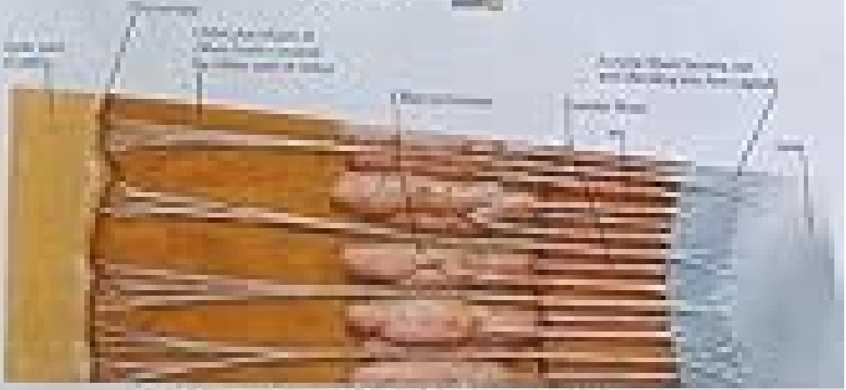
Diagram illustrating the structure of the eye wall and supporting structures.