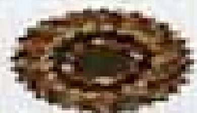
1999-2000 Honeycomb & page 18