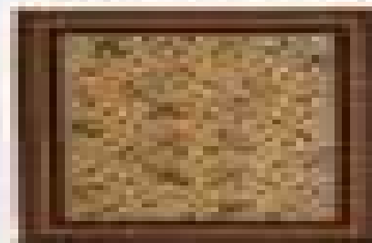
1999-2000 Honeycomb & page 18