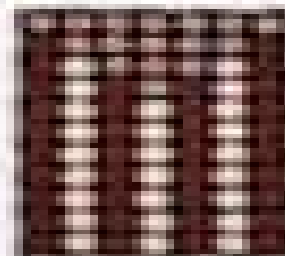
1999-2000 Honeycomb & page 18