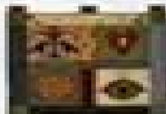
1999-2000 Honeycomb & page 18