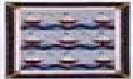
1999-2000 Honeycomb & page 18