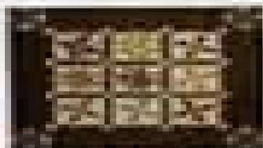
1999-2000 Honeycomb & page 18