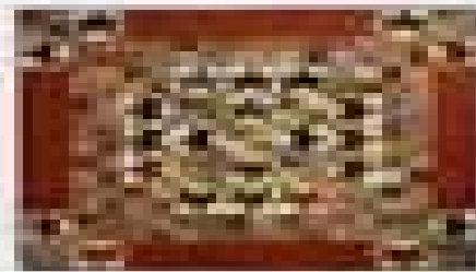
1999-2000 Honeycomb & page 18