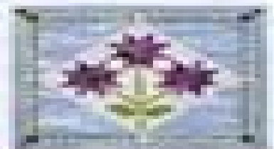
1999-2000 Honeycomb & page 18