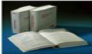
ABB Switchgear Manual

More than 50 years after publication of the first edition of the BBC Switchgear Manual by A. Hoppner, we present to you the current edition of today's ABB Calor Emag Switchgear Manual in the internet the first time. As always, it is intended for both experienced switchgear professionals as well as beginners and students.