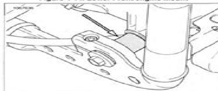
Figure 4-15. Spacer Installed Properly