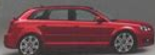
Audi A3 Sportback Owner's Manual