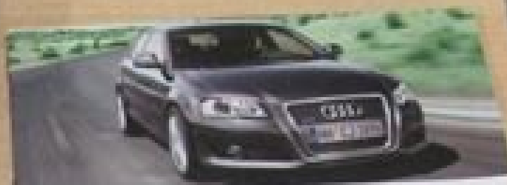
Audi A3 - SE - RS Quick reference guide