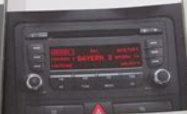
Radio Operating Manual