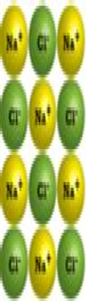
Sodium Chloride Crystal