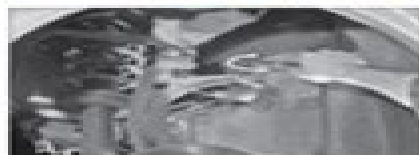
Step-by-step front suspension component replacement. 40 Front Suspension