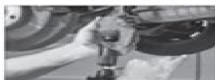
Detailed front and rear brake service. 46 Brakes—Mechanical