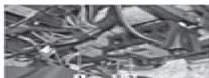
Fuse boxes, relays and grounds using an extensive electrical component locator. 97 Fuses, Relays, Component Locations