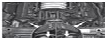
Timing belt replacement (2.8 liter engine). 13 Timing Belt, Crankshaft Pulley, Rear Main Seal