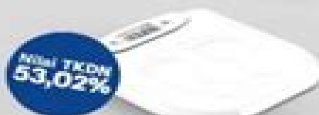
Timbangan Digital Bluetooth