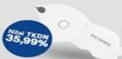
Alat Ukur LILA