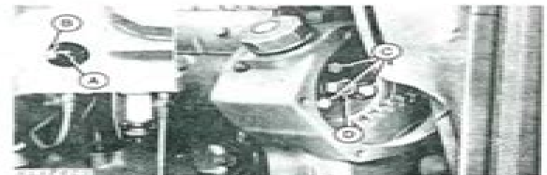
A—Drive Hub Mark B—Pointer Mark

5. If timing is correct, replace plugs and reconnect hose.