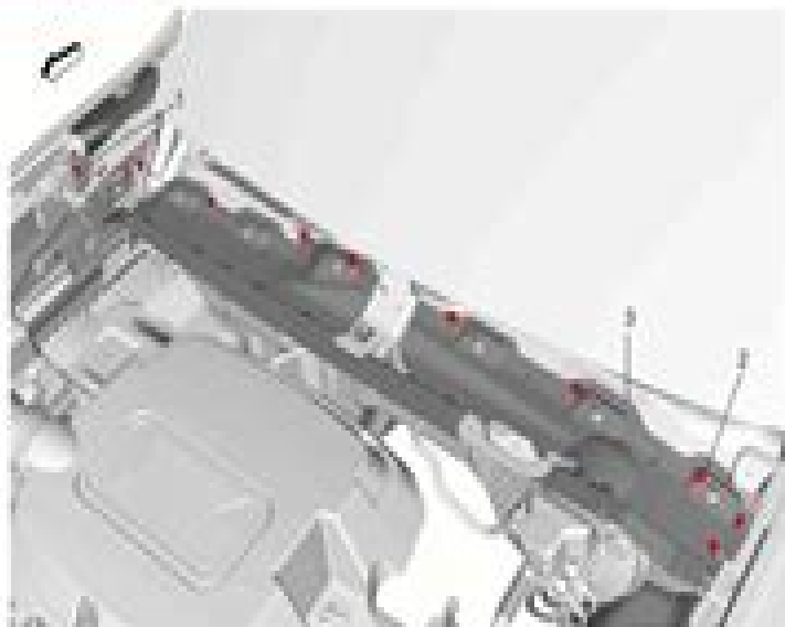
Fig. 25. Platinum Front Panel