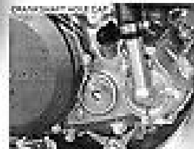
CRANKSHAFT HOLD CAP