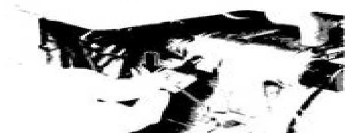
1. Tilt lever