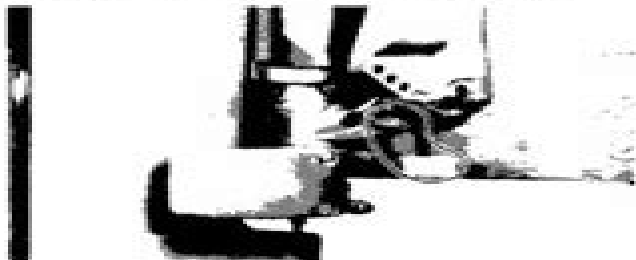
1. Normal position

This system allows cruising in shallows by inclining the outboard motor 20 degrees, although previously this was not possible.