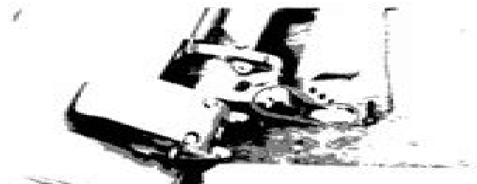
1. Set position