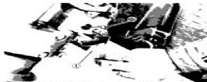
1. Shallow water drive lever