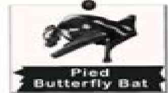
Pied Butterfly Bat