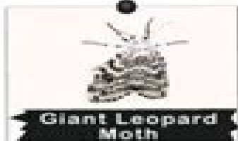
Giant Leopard Moth