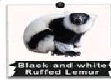
Black-and-white Ruffed Lemur