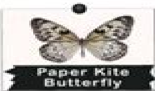
Paper Kite Butterfly