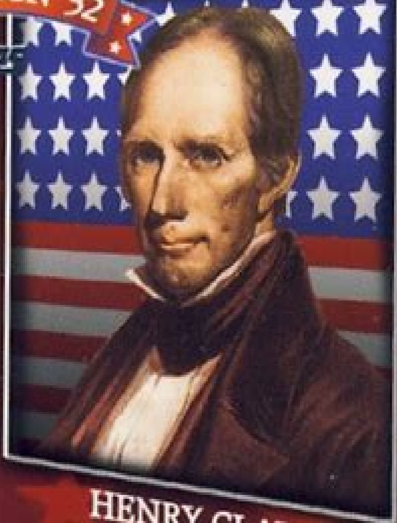
HENRY CLAY National Republican