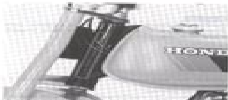
The frame serial number is stamped on the swing fork (left side).