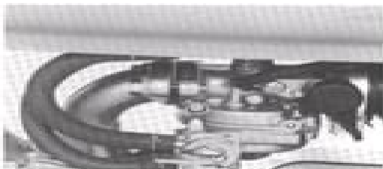
The carburetor identification number is stamped on the carburetor body (left side).