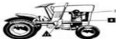
Right side view