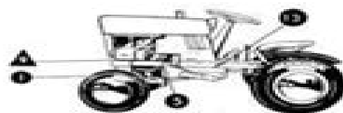
Left side view

▲ Oil with can ■ Change Oil ● Grease with low pressure or hand gun ● Check gear lube