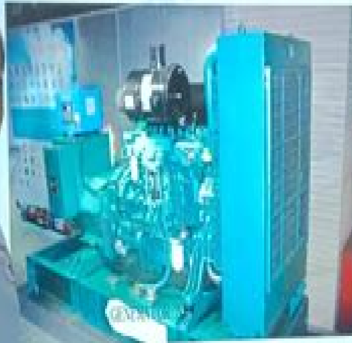
Water Cooled Diesel Generator