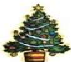
a Christmas tree