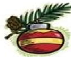
a Christmas decoration