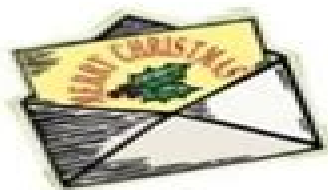
a Christmas card