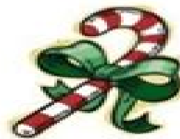
a candy cane