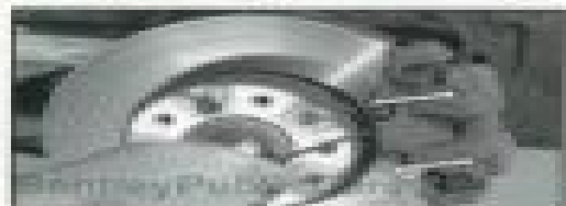
Detailed brake pad and rotor service. 340 Brakes.