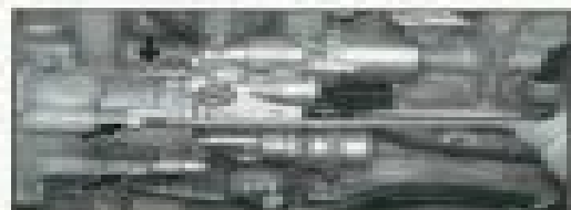
Service the high-pressure fuel system on turbo models, including replacing N55 fuel pump, 100 Fuel Tank and Fuel Pump.