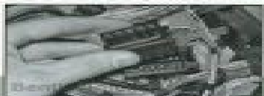
Extensive electrical component location information. 600 Electrical Component Locations.