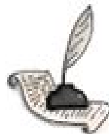
LITERATURE & WRITING