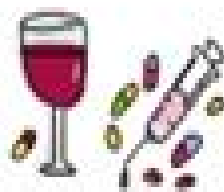
DRUGS & ALCOHOL