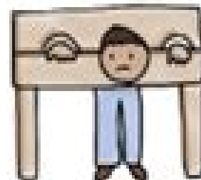
FREEDOM & CONFINEMENT