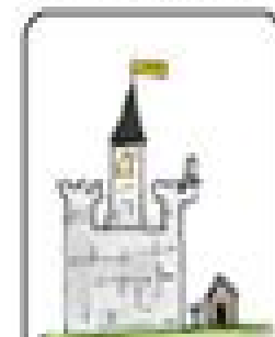
SOCIETY & CLASS