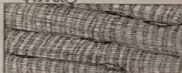
F Skeletal muscle