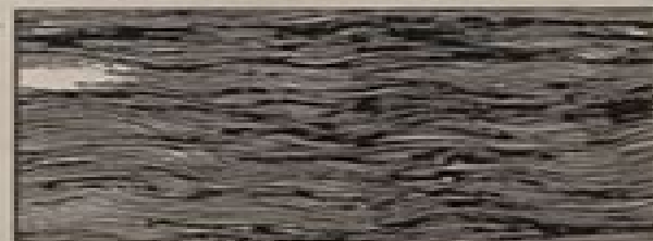
D Dense Fibrous Connective tissue