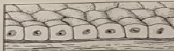
B Simple Cuboidal epithelium