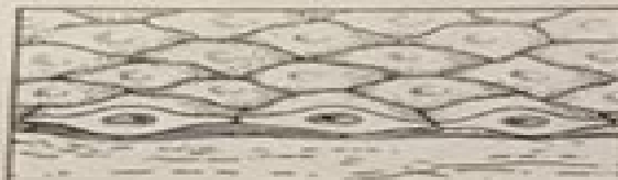
A Simple Squamous epithelium

Matrix (Where found, matrix should be colored differently from the living cells of that tissue type. Be careful, this may not be as easy as it seems!)