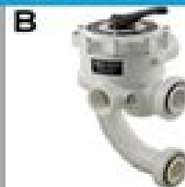
SM2PP3 - Praher Model