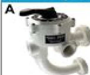
SM1PP3 - Praher Model