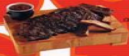
Championship-winning ribs and smoky ribs from Illinois