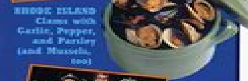
RHODE ISLAND Clams with Cauli, Pepper, and Parsley (and Mussels, too)