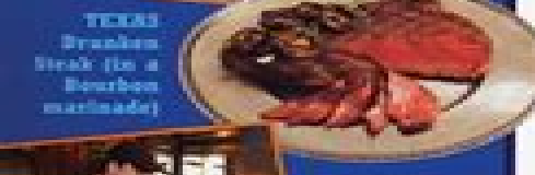
TEXAS Braden Steak (in a Bourbon marinade)