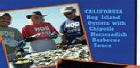
CALIFORNIA Key Island System with Chipotle Honeydew Barbecue Sauce