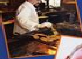
WASHINGTON Rider-Grilled Salmon With Citrus Butter