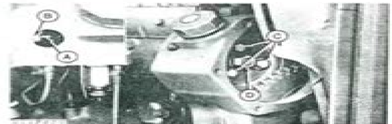
A—Drive Hub Mark B—Pointer Mark C—Cap Screws D—Pump Drive Shaft Nut

5. If timing is correct, replace plugs and reconnect hose.