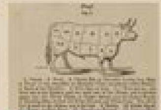
6 Chapter Six: Boundaries