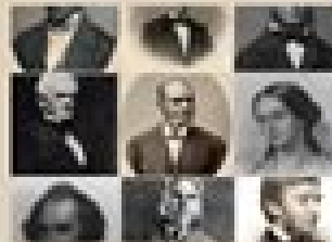
4 Chapter Four: Reflections