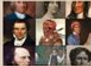
1 Chapter One: Revelations

The sixty years between 1800 and 1860 saw the politics, religion, language, literature, art, population, and economy of the young United States change with remarkable speed, forever shaping American history. To help see the variety and depth of those changes, this StoryMap offers a geographic and chronological map of the era, connecting to helpful websites, a traveling that explores places today, and learning resources for use in classes. It presents portraits and images of people who confronted the challenges and opportunities of these critical decades of American history. The stories of those people and of this time are explored in the book that inspired this project: American Visions: The United States, 1800–1860 , by Edward L. Ayers.