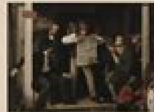
5 Chapter Five: Explorations