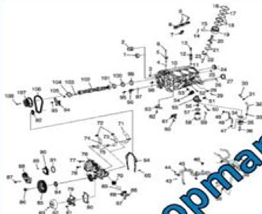
Fig. 3: Engine Block and Components