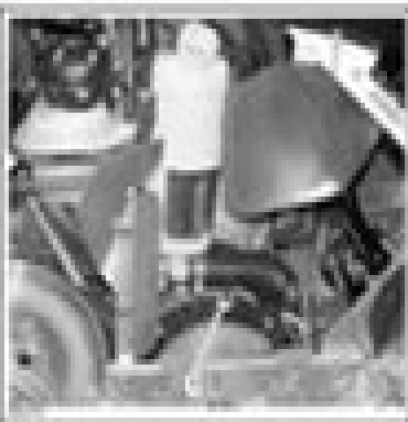
1. Disconnect battery and starter cable.

Unplug from the coolant reservoir the hose going to the engine.