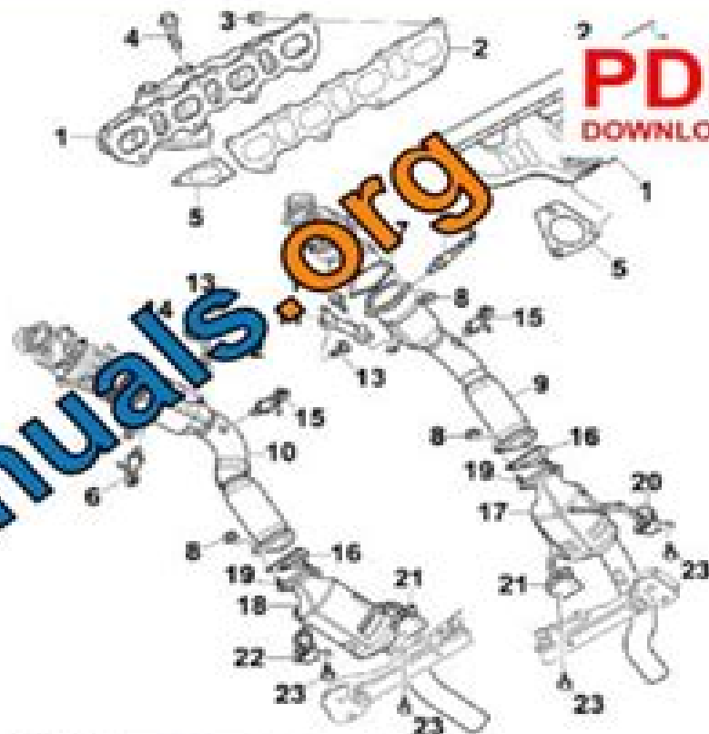
Fig. 88: Component overview - Cayenne Turbo