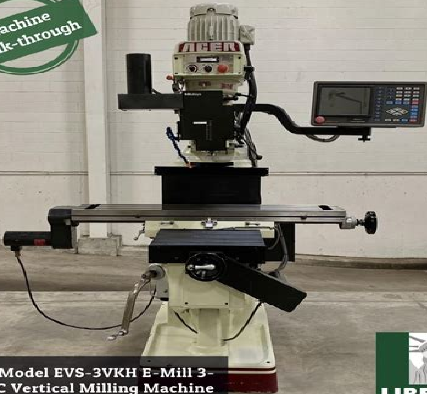
Acer Model EVS-3VKH E-Mill 3-Axis CNC Vertical Milling Machine