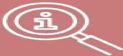
Finding missing information