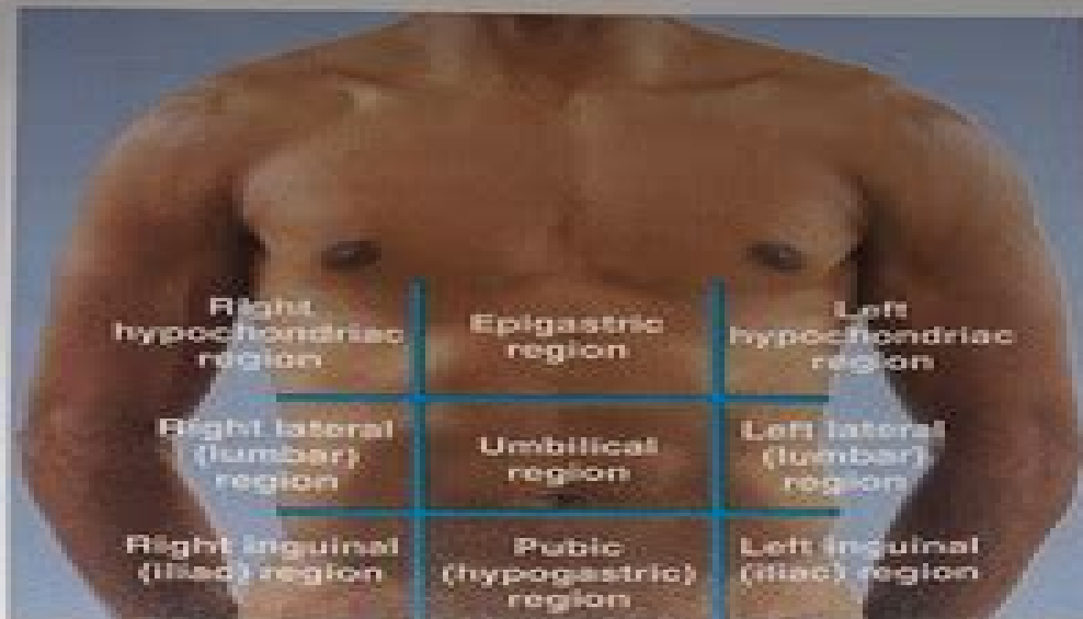
(a) Nine regions delineated by four planes